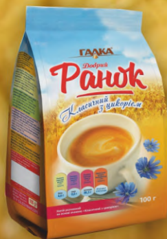
CLASSIC with CHICORY