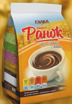
SPECIAL with COCOA