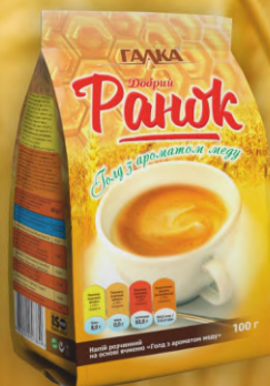
GOLD with HONEY