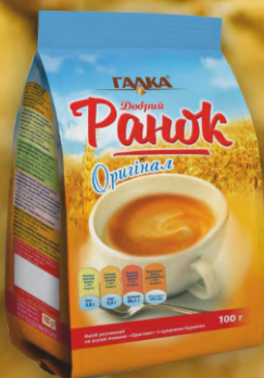
ORIGINAL with SUGAR BEET